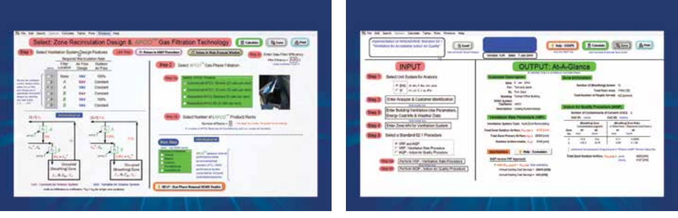
Software programs introduced by air-cleaning device manufacturers have made the process of calculating ASHRAE 62.1 IAQP procedure for estimating outdoor air in commercial buildings as easy as filling out a job application.