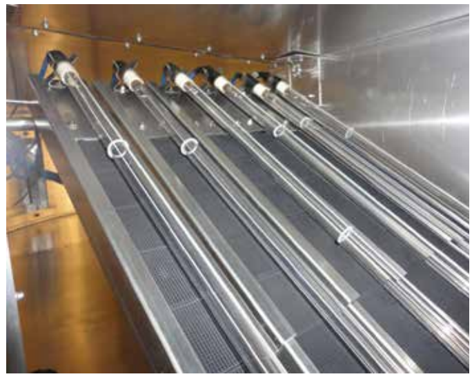
☆ A simulated airstream microbe inactivation in an ASHRAE Standard 52.2-certified environmental duct test chamber by the third-party IAQ device test facility in Airmid Healthgroup AHG (Dublin, Ireland). Contractors, engineers and building owners relying on air-cleaning devices to help reduce their outdoor air and subsequent energy savings under ASHRAE 62.1 IAQP allowance in commercial buildings should make sure their chosen air-cleaning equipment provides what the vendor claims via third-party test results.

pre-gathered information, such as peer-reviewed CoC typically found in buildings, for example.